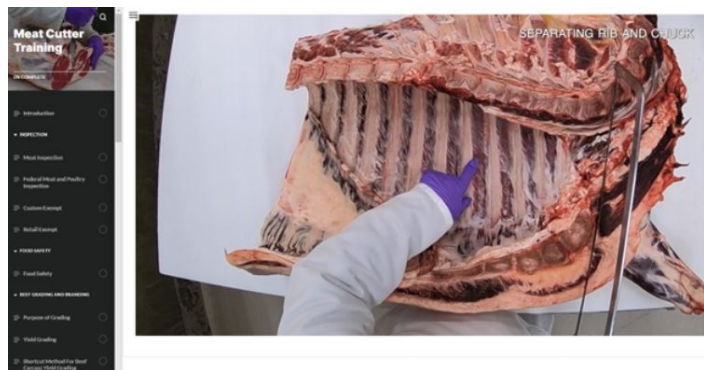
Figure 1. Screenshot of 1 of 13 beef fabrication videos demonstrating separating the beef rib from the beef chuck.

Offered on-demand, the online meat cutter training course includes multiple demonstrational videos on pork and beef carcass breakdown (Figure 1) into wholesale, subprimal, and retail cuts.