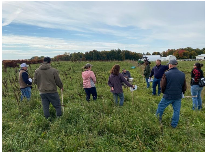
2022 Beginner Grazing School participants lay out paddocks for Lake City cattle.